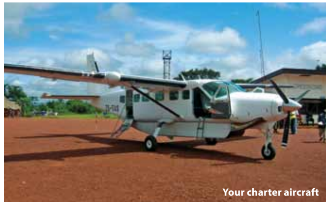
Your charter aircraft

This morning you will be transferred to Bangui Airport for your international flight home.