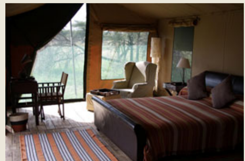
Lemala Mara Classic 4 ★