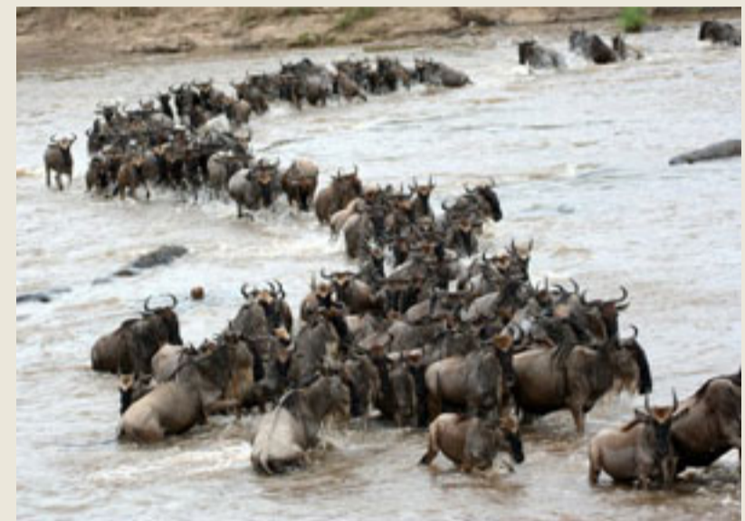
Great Migration - Serengeti National Park