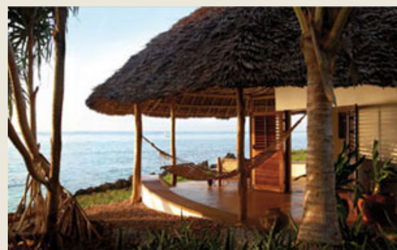
Matemwe Lodge Dive Resort Classic 4 ★