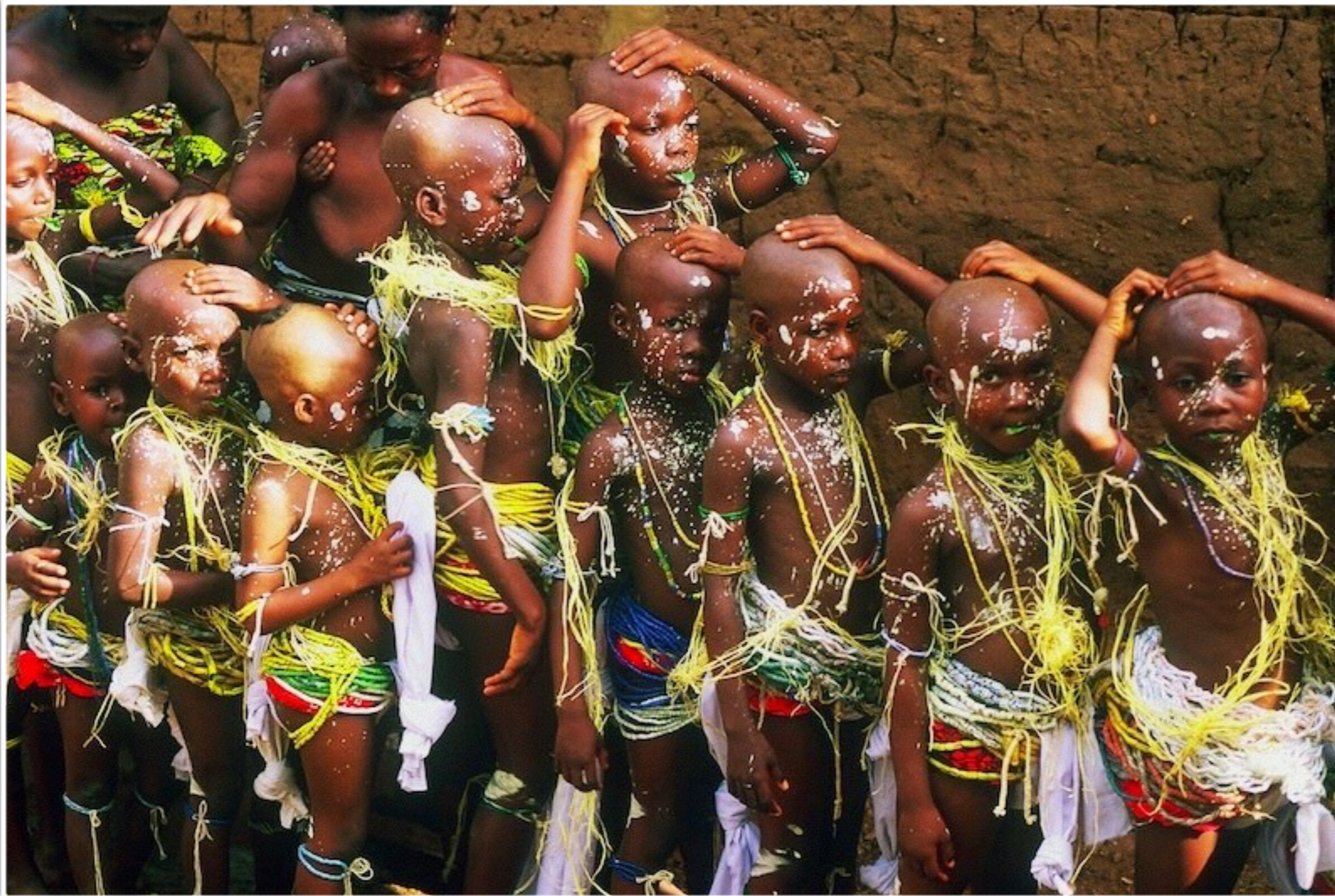
Dipo ... the “process” through which a young girl becomes an adult woman, fully integrated within her society.