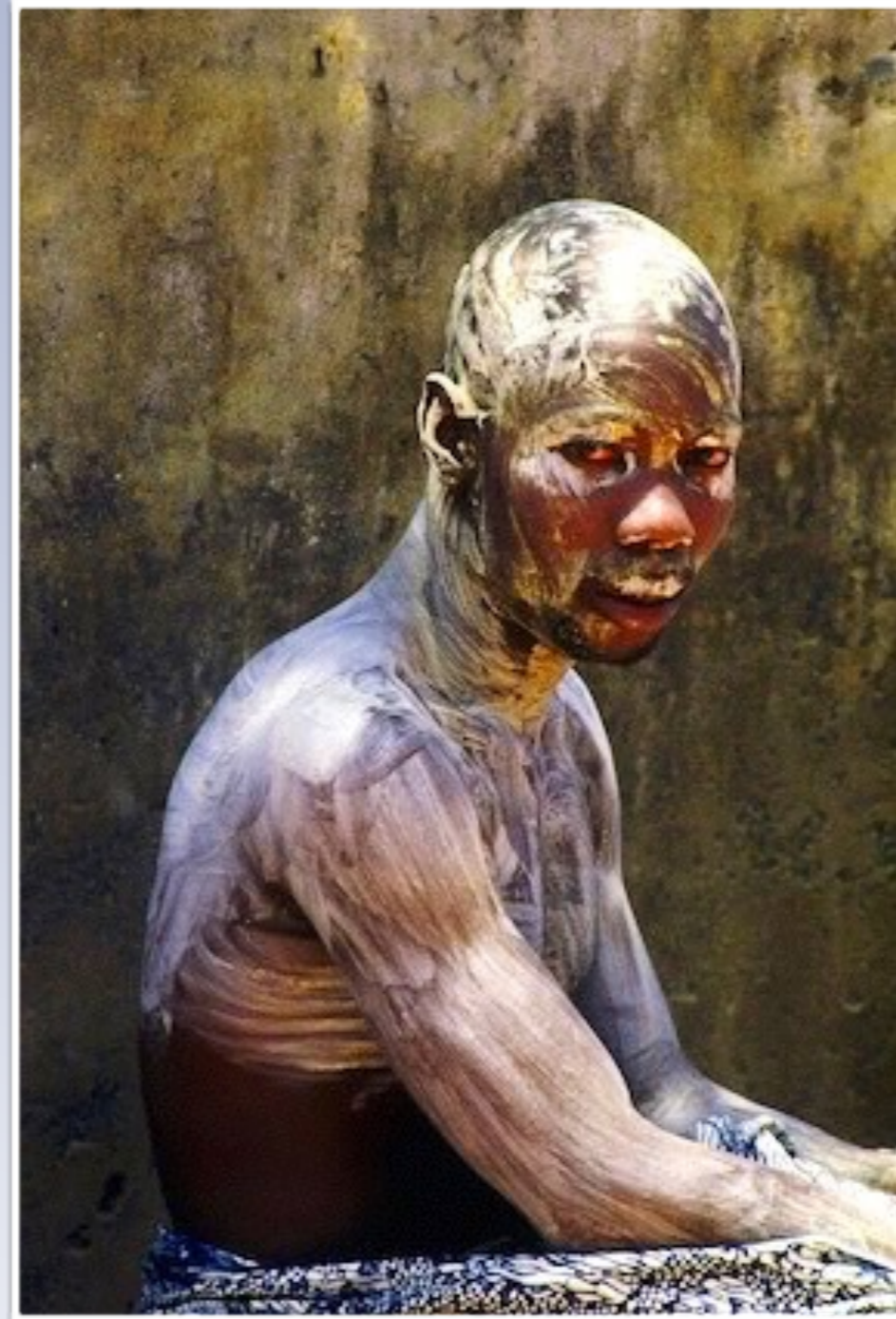
Initiation time: for young girls and for young men