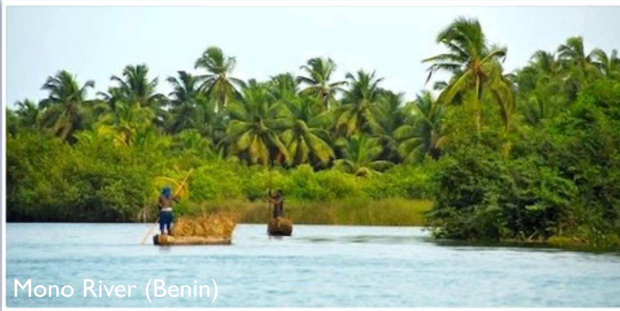
Mono River (Benin)