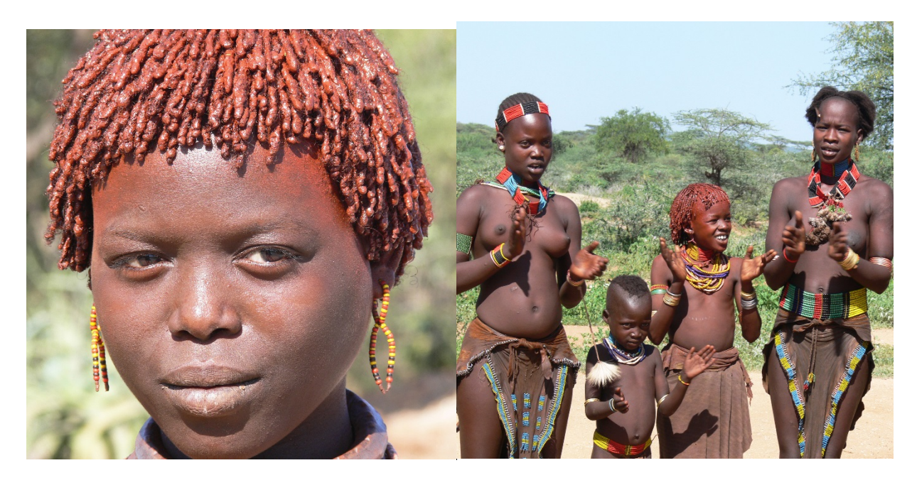
Day 12: To Kolcho

A day trip takes you to the Karo people that live along the River Omo.