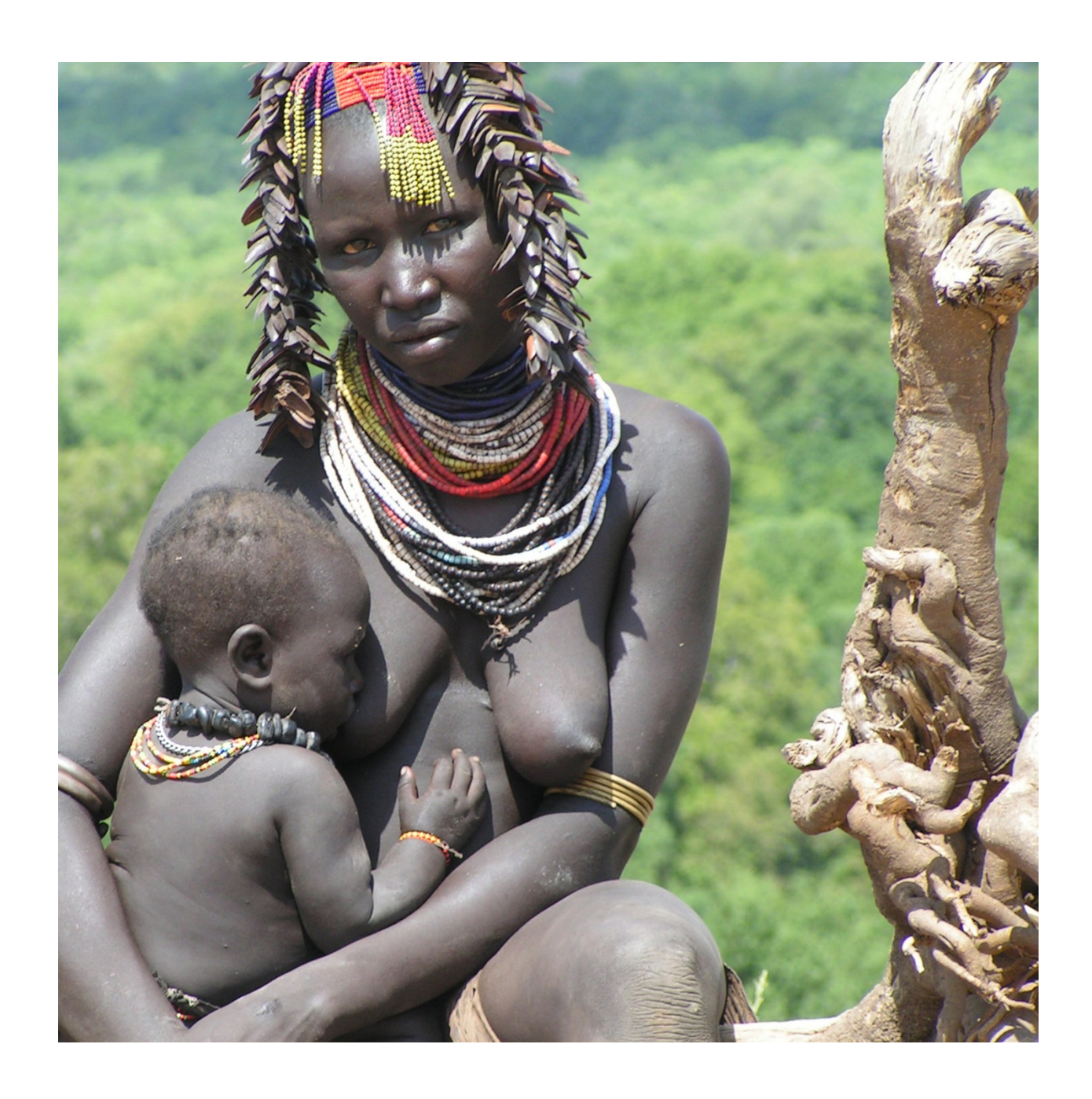
Day 13: Omo Rate and Drive to Konso

Cross the River Omo in a canoe to visit the Tsenai people in Erbore. Afterwards you get to meet the Galeb people in Dhesanech.