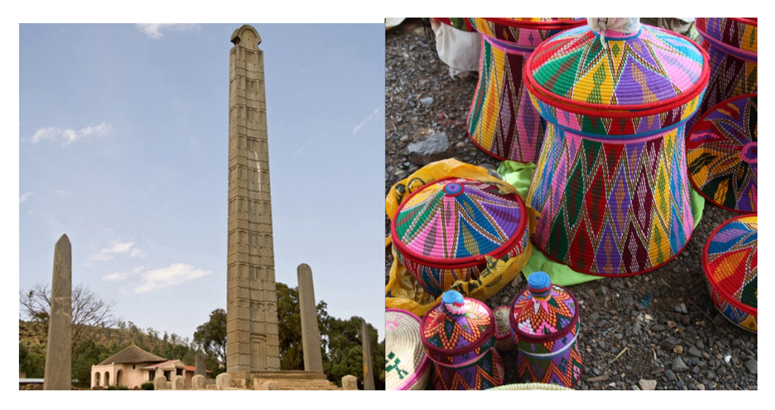
Day 6: Fly to Lalibela

Overnight: Yared Zema Hotel (www.yaredzemainternationalhotel.com). Breakfast, lunch and dinner are included.