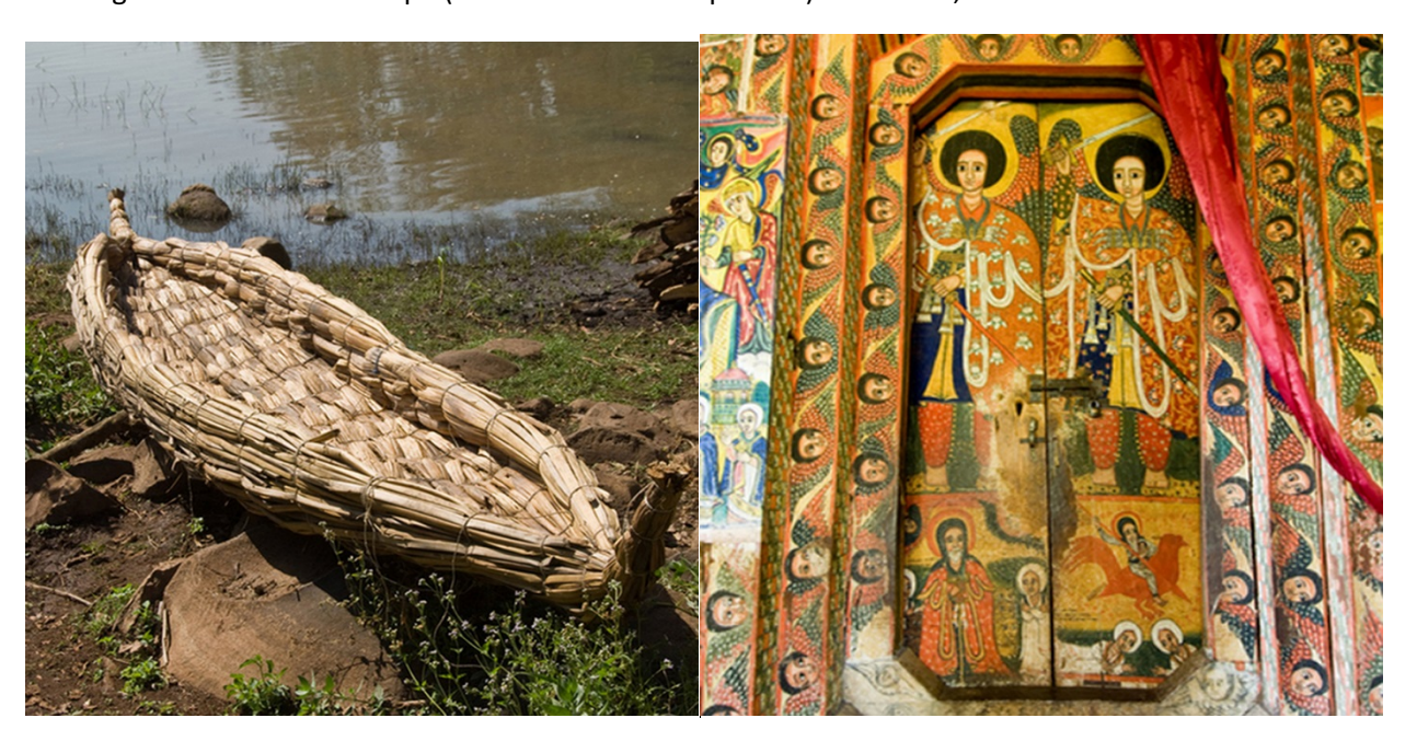
Day 3: Full Day Boat Trip on Lake Tana

Overnight: Kuriftu Resort & Spa (www.kurifturesortspa.com). Breakfast, lunch and dinner are included.