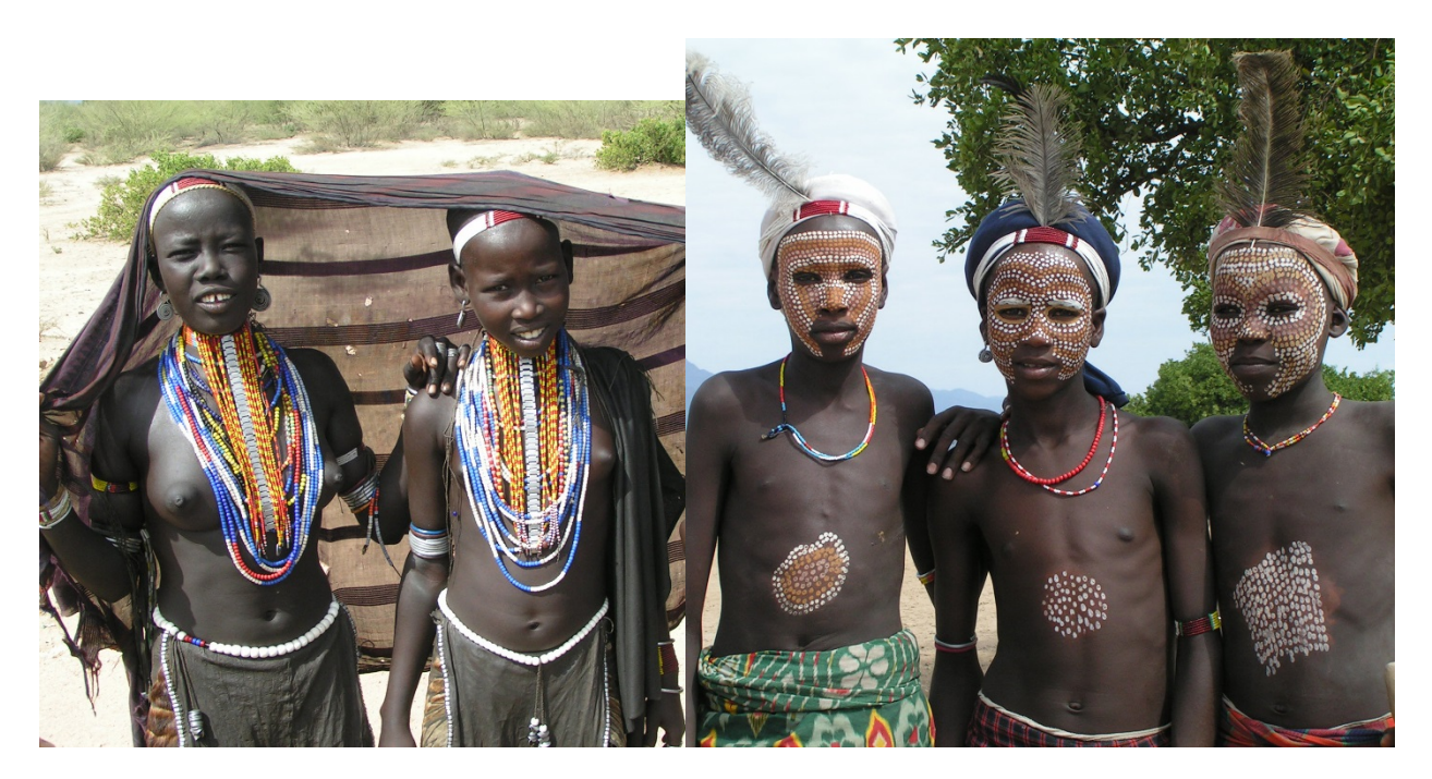
Day 14: Drive to Yirga Alem

Yirga Alem is nestled between coffee fields and lush green. The nearby forest is home to a variety of endemic mammals.