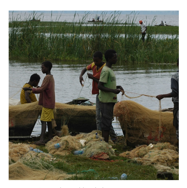
Day 17: Drive Back to Addis Ababa

On your way back to Addis Ababa you visit the Stelae Field of Tiya, listed by UNESCO as a World Heritage Site