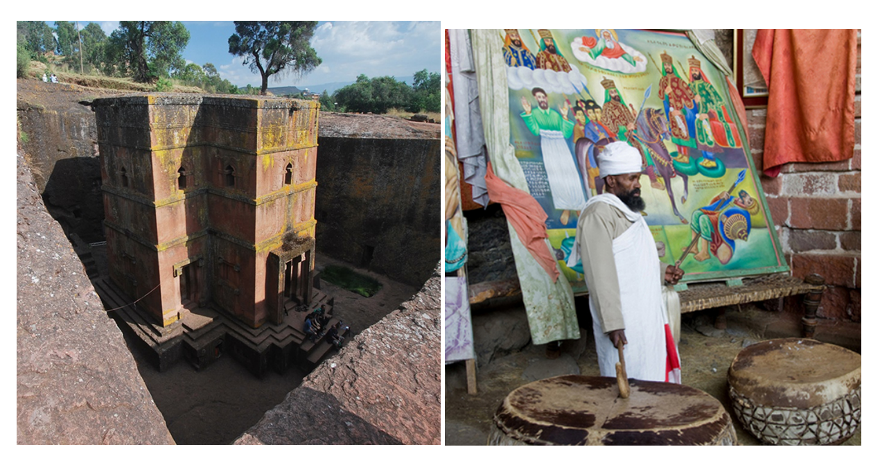
Day 7: Excursion to Nakuto Laab, Asheton Maryam or Yemrehane Christos

Overnight: Mountain View Hotel (www.mountainviewhotel.com). Breakfast, lunch and dinner are included.