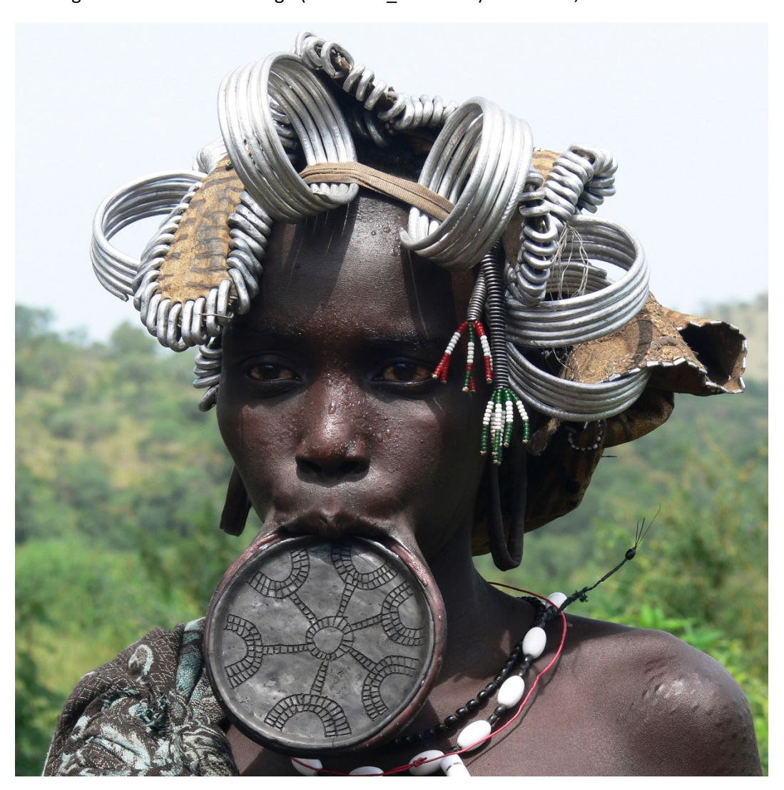
Day 11: Drive to Turmi

Overnight: Eco Omo Safari Lodge (www.eco_omo.com). Breakfast, lunch and dinner are included.