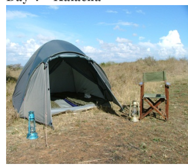
Day 4 – Kalacha

We visit Marsabit town and another back into the desert and lava flows. Lunch Chalbi Desert (impassable if wet) as we a small settlement on the edge of the Chalbi people (pastoralists particularly attached to