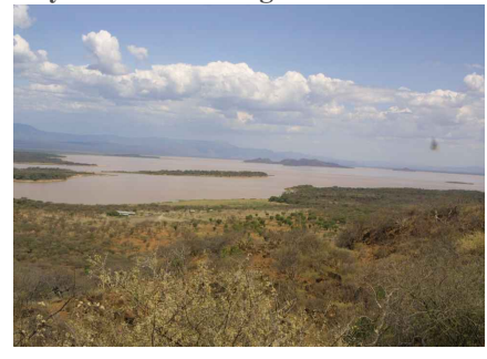
Day 9 - Lake Baringo

Heading south we visit Lake Baringo where we spend the night at a campsite sleeping amongst the grazing hippos. L. Baringo is the most Northerly of Kenya's small Rift Valley lakes; creased with papyrus and well developed acacia forest. Hippos, crocodiles and monitor lizards, numerous birds are effortlessly seen from the shore.