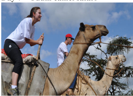
Day 7 - Tuum camel safari

Departing Lake Turkana via the very rocky road out of the Rift Valley we head south to Tuum, situated on the west of Mt. Nyiro which stands to the East of the Suguta Valley. This is a very scenic but rough drive through lava flows to the broken sands on the edge of the Kaisut desert.