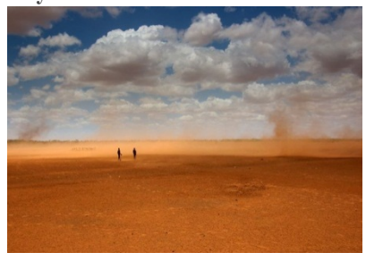
Day 5 - Lake Turkana

We break camp and depart early, crossing the outskirts of the Chalbi Desert transiting North Horr before arriving at Loyangalani town; the base of Lake Turkana. (It is the largest desert lake in the world and extends for 288