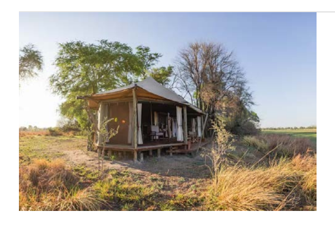
Day 4 Musekese Camp Musekese-Lumbeya (Kafue), Zambia 3 nights