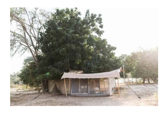
Day 3 Chula Island Camp Lower Zambezi, Zambia 2 nights

Our 'transfer' between Kutali and Chula is taken at the whim of the wildlife and your guide - we leave the timing and means of transport to the team on the ground. Sometimes a morning drive is in order, maybe a canoe, maybe a walk, all options to get you to your next camp.