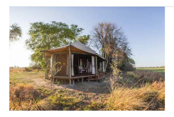
Day 5 Musekese Camp Musekese-Lumbeya (Kafue), Zambia 4 nights