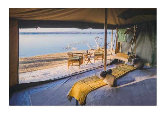
Day 1 Kutali Camp Lower Zambezi, Zambia 2 nights