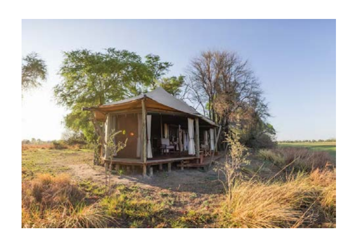
Day 1 Musekese Camp Musekese-Lumbeya (Kafue), Zambia 4 nights