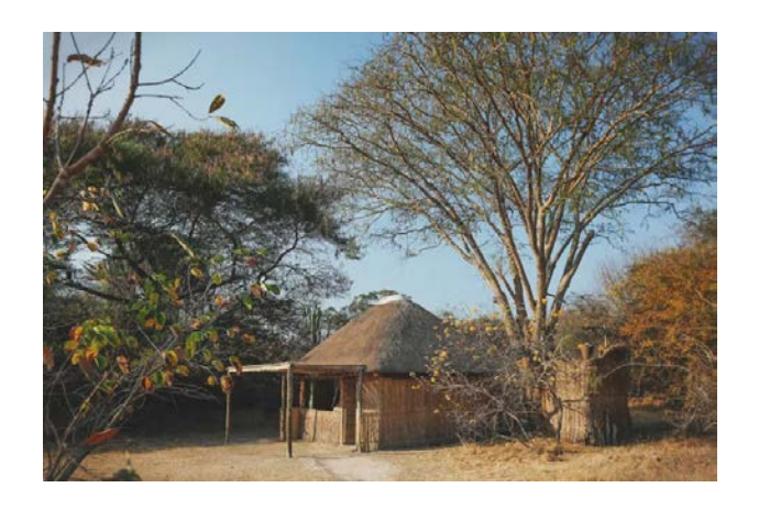
Day 5 Ntemwa-Busanga Camp Busanga Plains (Kafue), Zambia 4 nights